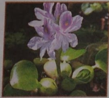
1. Water hyacinth